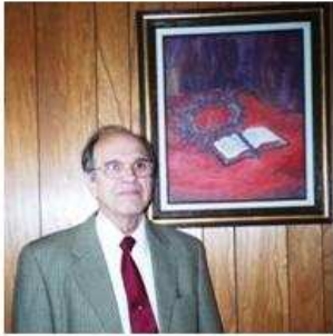
Ron Bartanen, Minister